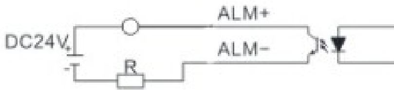
Alarm in place output wiring diagram